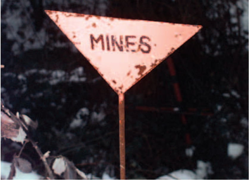
The ever-present sign of danger

peace was maintained, as one brigade commander ruefully observed, “partly because the sides want peace, but also by cajoling, coaching, and outright compelling peace.” It was difficult work.