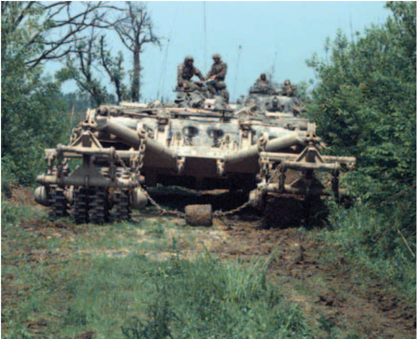
The experimental Panther used for mine-clearing operations

influx of returning refugees forced Task Force Eagle personnel to conduct mine-awareness classes for the indigenous population. Comic books were among the more popular instructional handouts used to warn children (and adults) about the dangers of land mines and how to recognize them.