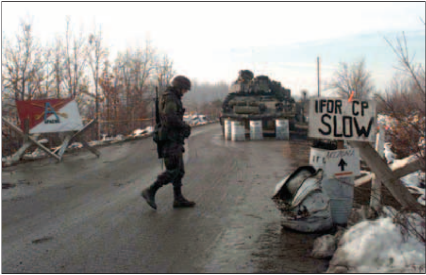
Typical U.S. Army checkpoint in Bosnia-Herzegovina

directed at U.S. troops or equipment, but none of the shots hit the intended targets. Once a hand grenade was thrown at an armored vehicle, but it caused no damage. Other episodes occurred, for example, a rock or an empty bottle being hurled at a passing patrol, but they were few in number. As the weeks went by, patrol operations and checkpoints became a common activity performed by IFOR and casually observed by the local civilians. In time, fighting the tedium and staying alert weighed heavily on most of the U.S. forces in MDN (N).