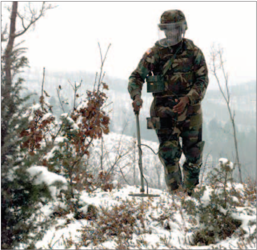
Sweeping for mines

Predeployment training regarding mines and booby traps had been intense and thorough, but accidents still happened—often in a thoughtless or unguarded moment. A typical episode occurred when Army engineers accompanied a Bosnian Serb officer to investigate a mine explosion in an area that had been declared cleared of mines. As they approached the area, their Bradley vehicle struck an explosive device and was disabled. A lieutenant immediately jumped off the vehicle to investigate the damage, in the process detonating an antipersonnel mine; he was thrown into the air and landed on an antitank mine that, fortunately, failed to explode. In another incident, when a military vehicle traveling on a hard-surface road used daily struck an antitank mine, Army engineers learned that the former warring factions occasionally placed